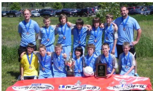
U12 Boys 8v8