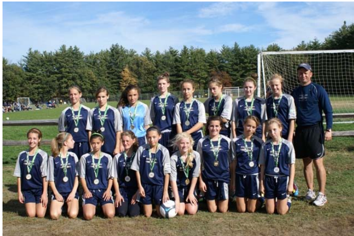
Nashua World Cup Columbus Day Champions - U14 Girls Seacoast