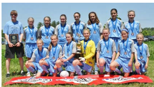
U12 Girls 8v8