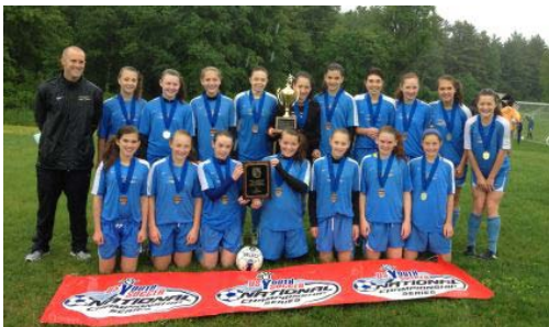
U13 Girls Premier

Seacoast United was founded in 1992 and is based in Hampton, NH with facilities in Epping NH, Kingston NH, York ME, and Topsham ME. The Club is a member of the U.S. Soccer Development Academy and the Northeast Pre-Academy League, as well as US Club Soccer, the New England Premiership, Granite State League, and USL's Super Y League. Information on Seacoast United Soccer Club teams and programs can be found online at www.seacoastunited.com .