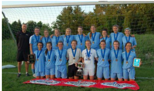
U17 Girls Showcase