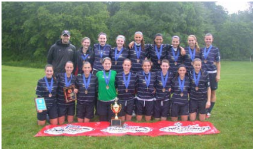
U16 Girls Showcase