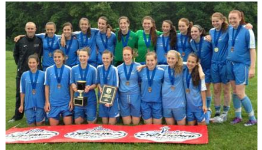
U15 Girls Showcase