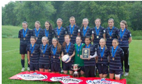
U14 Girls Premier